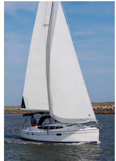
e36 Cruising Version